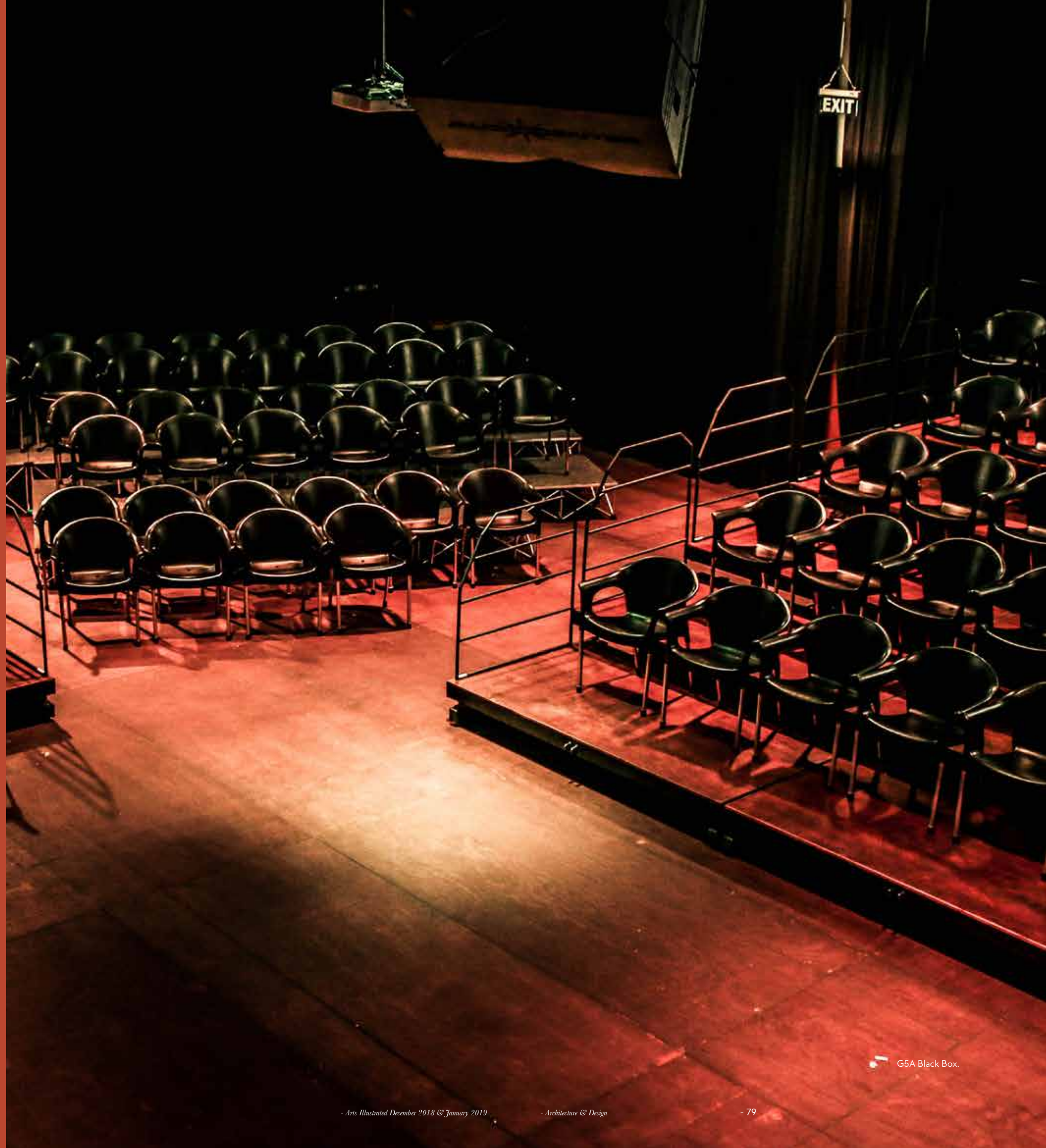
G5A Black Box.