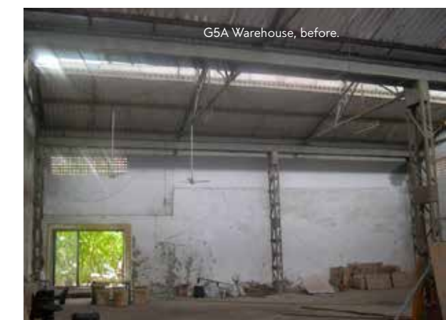
G5A Warehouse, before.