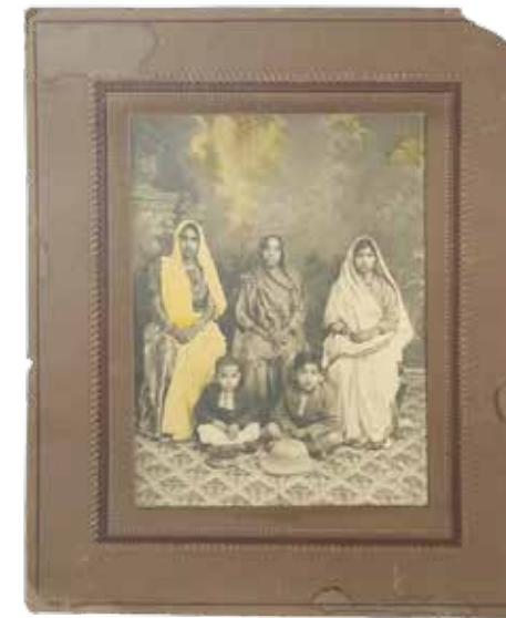
The original photograph used for the cover