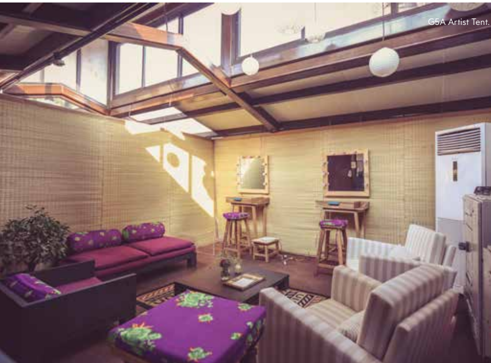
G5A Artist Tent.