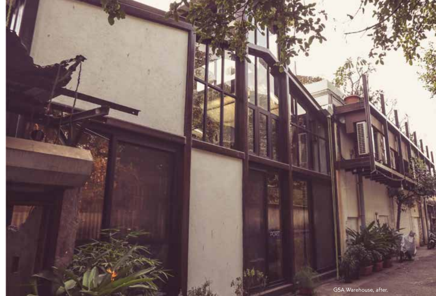
G5A Warehouse, after.

After winding through the alleys of the Shakti Mills Lane, it is disorienting to open the doors of G5A and find a stairway that soars from the entrance up to the terrace with two wings on either side acting as a mezzanine. But before we go up, we must pause at the cafe on the ground floor that has, since May 2018, become PORT Kitchen & Bar. PORT has a living room vibe,